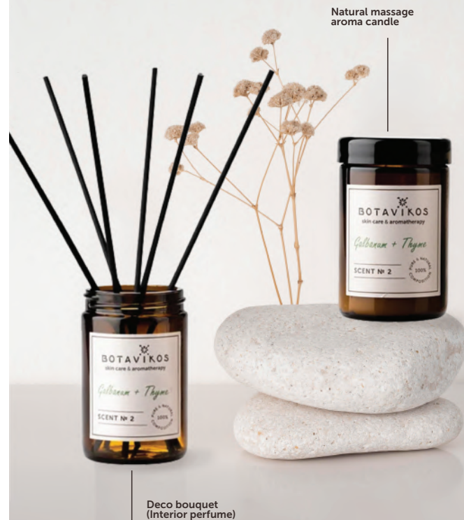
Deco bouquet (Interior perfume)

bergamot, lemon, thyme, lime, mint, galbanum, neroli