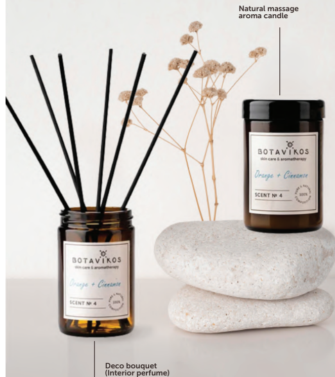
Natural massage aroma candle

orange, bergamot, cedar, frankincense, rosewood, elemi, cinnamon, rose