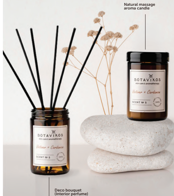
Natural massage aroma candle

grapefruit, vetiver, rosewood, gurjun balsam, cardamom, sweet orange, benzoin gum