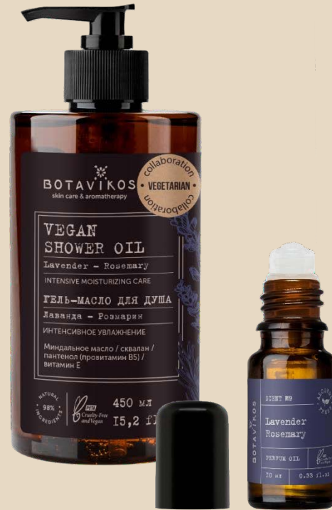
Vegan Shower Oil Lavender – Rosemary + SCENT 9. Lavender – Rosemary Perfume Oil