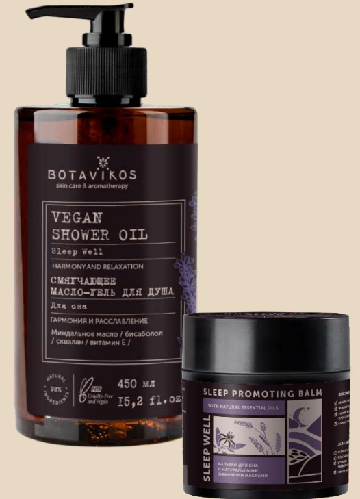
Vegan Shower Oil with essential oils + Sleep promoting balm SLEEP WELL with essential oils