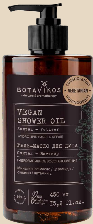
Vegan Shower Oil Santal - Vetiver 450 ml