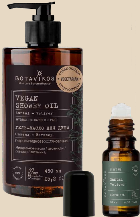
Vegan Shower Oil Santal – Vetiver + SCENT 8. Santal - Vetiver Perfume Oil