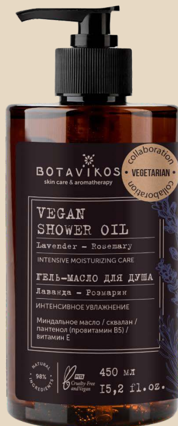
Vegan Shower Oil Lavender - Rosemary 450 ml