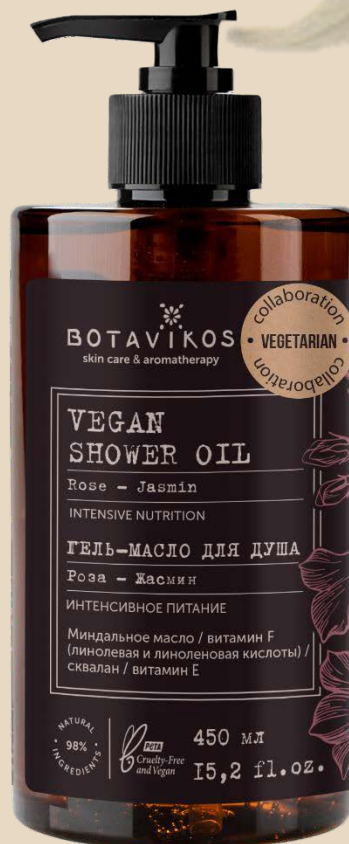
Vegan Shower Oil Rose - Jasmin 450 ml