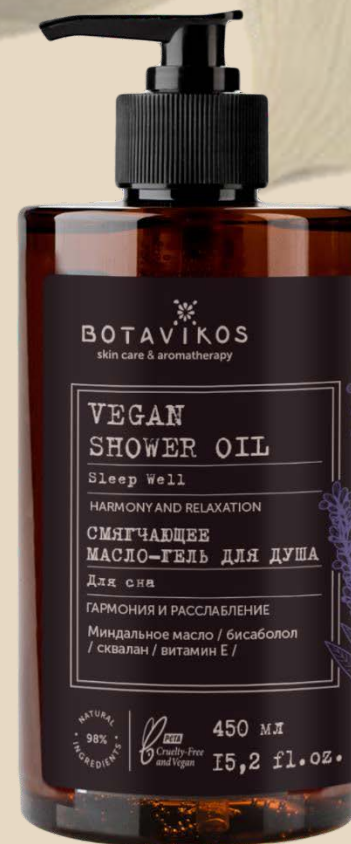
Vegan Shower Oil SLEEP WELL 450 ml