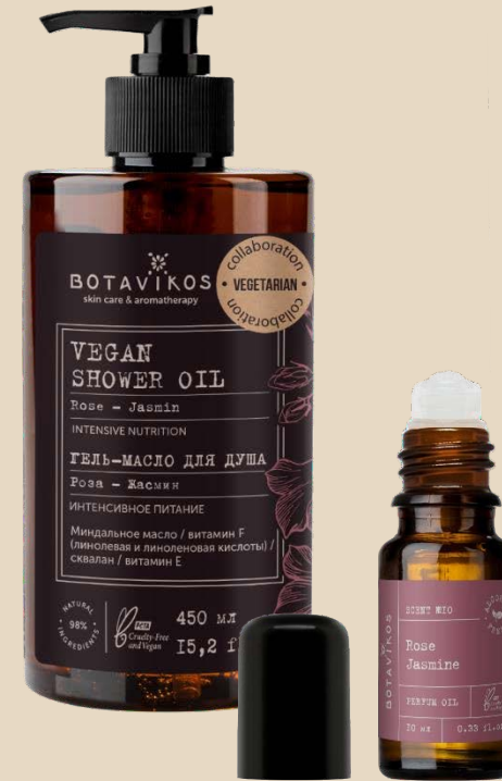
Vegan Shower Oil Rose – Jasmine + SCENT 10. Rose – Jasmine Perfume Oil